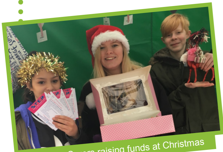
Young Carers raising funds at Christmas