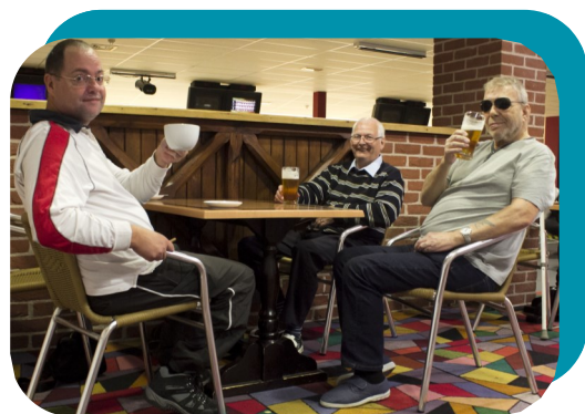
Social groups are essential for carers or as shown above, people with care needs

The survey showed that 86% of the family carers had no other breaks apart from the ones organised by us for the county council - underlining just how important it is for family carers to have social group options.